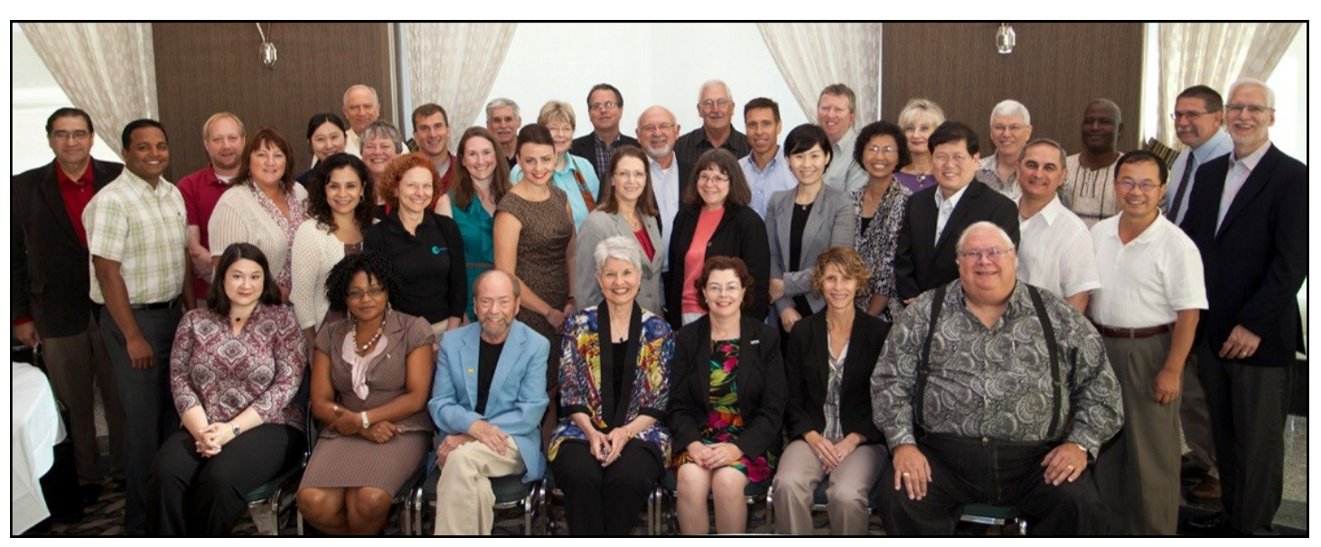
IAFP 2012 Affiliate Council Meeting

*Delegate is currently not an IAFP Member (a requirement under IAFP Bylaws).